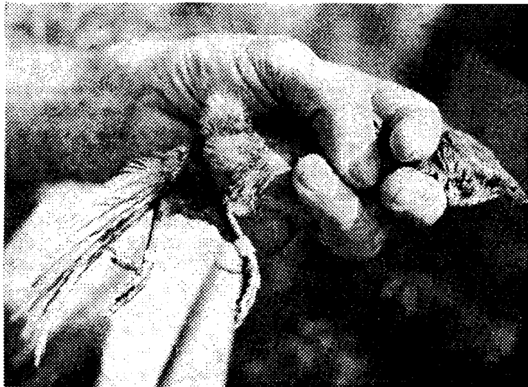
Noisy Scrub-bird, Two People Bay, Western Australia, Jan 5, 1964

For 71 years the sun aged south-western Australia. Ornithologists aged, too, but they discovered nothing about Noisy Scrub-birds. Then one day a naturalist laid down his fishing rod on the shore of Two People Bay, situated on the south coast 20 miles east of Albany, and ventured into the tangled