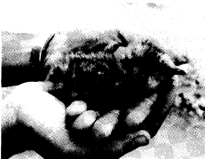
Gull-billed Tern chick, Stirling Range