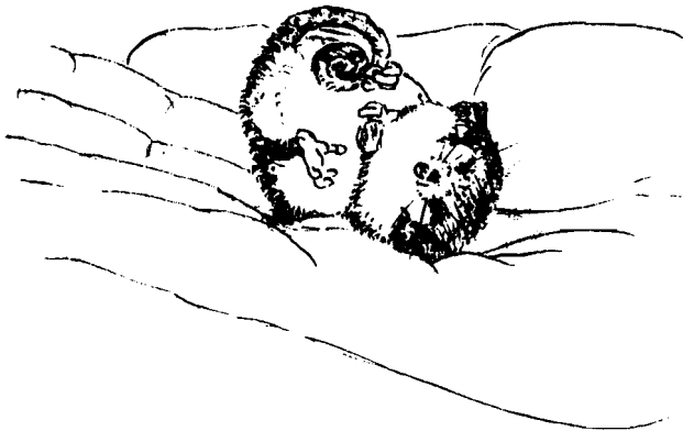
"Pygmy Possum at Eyre" by R. Smith.

Line pits and Elliot traps were set amongst the mallee along the north track, and another set of line pits were placed in the dunes above the house. Initially slow to respond, the small mammals eventually came to the party, showing a decided preference for the pit traps. Western Pygmy Possums were the main catch. If you haven't experienced this almost-weightless bundle of attractive brown and white fur, be assured that it is something of a wonder. Initially curled tight, head and ears down, eyes closed and tail spiralled, the possum gradually awakens from its torpor as it is rolled from hand to hand, examined, measured and weighed. Being inside the right warm jumper is also an inducement to come to life. Doug made such an impression on the last one that it refused to leave him, bounding delicately after the adopted father-figure as Doug backed away, even managing to climb up his leg.