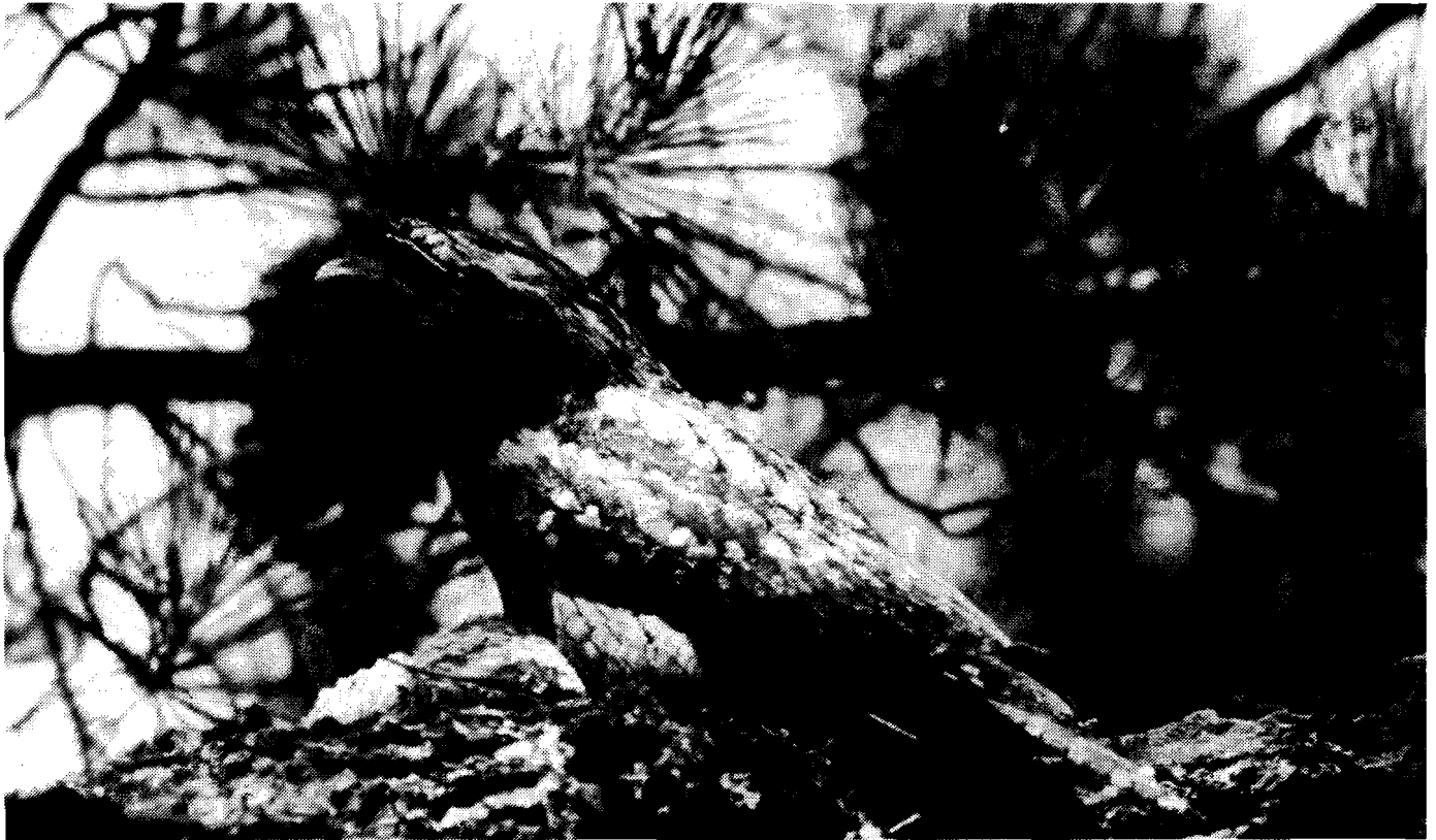
This Tawny Frogmouth successfully raised two chicks in a pine tree during December 1985. The nest was located in Bickley.