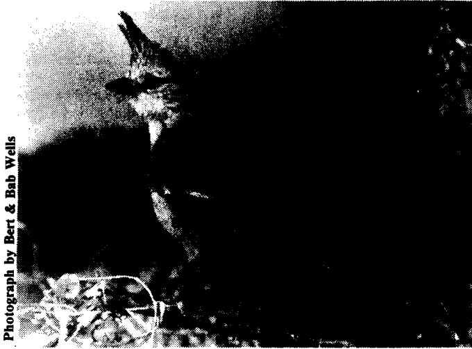
Observers visiting the Shark Bay region enjoyed the antics of Chiming Wedgebills, best remembered for their repetitive "did-you-get drunk" calls. See Members' Contributions.