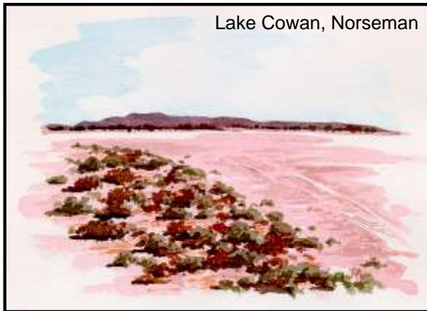
Lake Cowan, Norseman

There are several tracks on either side of the road as you drive north on the Esperance-Coolgardie Highway. Mallee and Salmon Gums are in abundance and the wild flowers in early spring are a magnet for the many species of birds found in and around the town of Norseman. Purple-crowned Lorikeet are in abundance, and can be found in the many trees in the streets of Norseman. Several species of raptors are also evident. Black-shouldered Kite, Brown Falcon and Wedge-tailed Eagle can be seen regularly throughout the Norseman area and the Shire of Dundas.