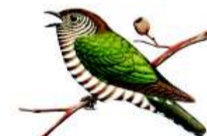
Shining Bronze-cuckoo Chrysococcyx lucidus

This native bushland park adjacent to areas of similar bushland is an important habitat for Grey Kangaroo, Western Brush-Wallaby and Short-nosed Bandicoot.