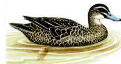
Pacific Black Duck Anas superciliosa

Until recently, Blue Gum was a marshy, fresh-water swamp and only a fraction of it's present size. Today it is an important refuge and breeding area for birds. Parking is available just off Canning Avenue.