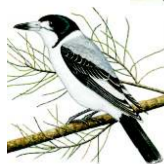
Grey Butcherbird Cracticus torquatus

The southern side of the lake has been retained as a banksia woodland with walk trails. The woodland is the permanent home of many birds, such as the Grey Butcherbird.