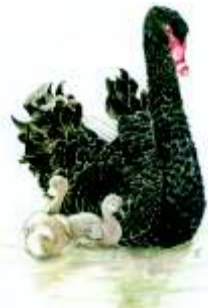
Black Swan Cygnus atratus

A series of parks run along the west bank of Bull Creek Estuary and along the creek south of Leach Highway.