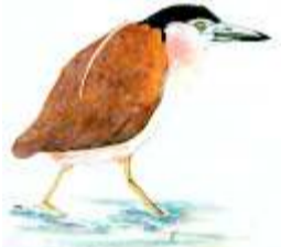
Nankeen Night-Heron Nycticorax caledonicus

You will come to a weir where you may see a Eastern Great Egret or Blue-billed Duck.