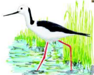
Black-winged Stilt Himantopus himantopus

The mud flats are the main feeding area for waders on the lower Swan Estuary. During summer over 48 species have been recorded as visitors to the mud flats, many of which have come from Northern Asia/Alaska in their annual migration.