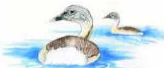
Hoary-headed Grebe Poliiocephalus poliocephalus

C. Across Farrington Road is North Lake. It's fringing reed-beds and thick vegetation is an ideal place for waterbirds and bushbirds. Look for swamphens, ducks and White-faced Heron.