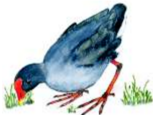
Dusky Moorhen Gallinula tenebrosa

Take a walk along the boardwalk to see cormorants, ibis, swans, grebes and other birds breeding in the melaleuca thickets.