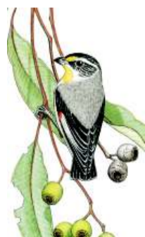
Striated Pardalote Pardalotus striatus

Many raptors visit the area. You should see an Eastern Osprey when you visit. Many birds can be seen on or over the open water - ducks, terns and cormorants.