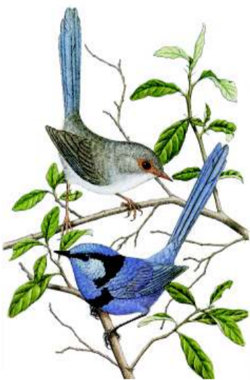
Splendid Fairy-wren Malurus splendens

The reserve is dominated by a melaleuca woodland, lake and bushland on the higher northern section. Entry to the reserve and parking area is from Leach Highway.