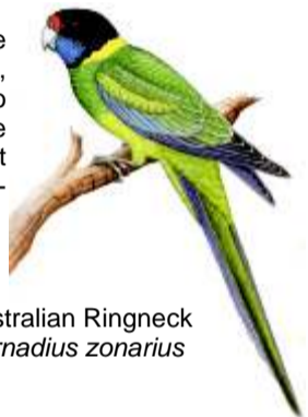
Australian Ringneck Barnadius zonarius

Welcome Swallow nest in the university buildings, Carnaby's Black-Cockatoo feed in the pine trees, and the open paddocks attract Australian Ringneck and Red-capped Parrot.