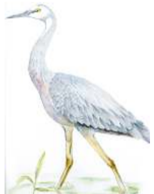
White-faced Heron Egretta novaehollandiae

Near the lake a variety of waterbirds can be seen, including Yellow-billed Spoonbill, Australian White Ibis, White-faced Heron and Purple Swamphen.