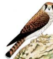
Nankeen Kestrel Falco cenchroides

In spring this is a good area to see the Rainbow Bee-eater, which breeds in underground tunnels (see cover).