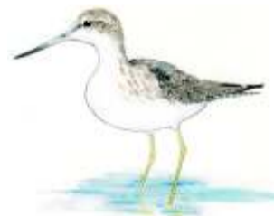
Common Greenshank Tringa nebularia

A pocket of natural estuarine marshland is the home and breeding area for 31 species, including the Buff-banded Rail, Spotless Crake and Black-winged Stilt.