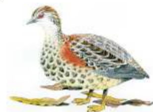
Painted Button-quail Turnix varia

It is one of the few reserves on the Swan Coastal Plain with Painted Button-quail.