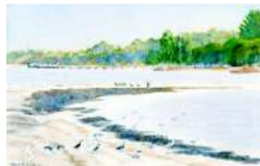
Point Walter Spit

At Point Walter there is a restaurant, shaded lawns and a parking area. When the tide is out, waders and other birds can be seen near the spit.