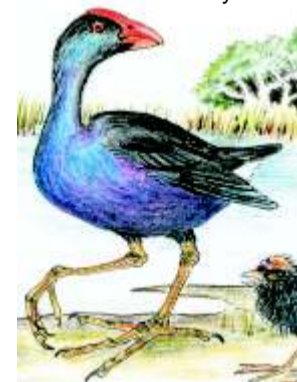
Purple Swamphen Porphyrio porphyrio

Many birds feed along the edge of the water and on the lawns.