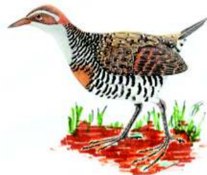
Buff-banded Rail Gallirallus philippensis

From Thomas Middleton Park and Bateman Park there are good views of the estuary with many waterbirds. You may see a Buff-banded Rail feeding. The old Bateman Homestead, 'Grasmere', built in 1886, still stands on a hill overlooking the swampy ground. A sign-posted boardwalk will take you to Yagan Park.