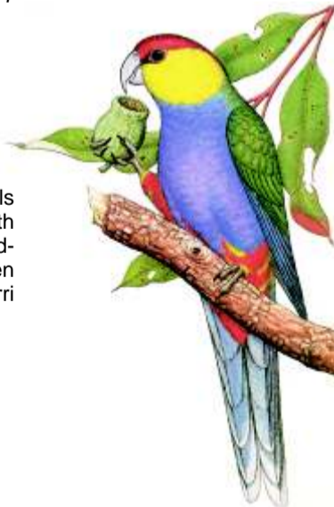
Red-capped Parrot Purpureicephalus spurius

A walk along the trails will reward you with many birds. The Red-capped Parrot is often seen feeding on Marri nuts and Parrot Bush.