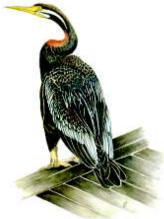
Australasian Darter Anhinga melanogaster

Blackwall Reach is 14 hectares of Class A reserve vested in the City of Melville. It was once the home of the Aboriginal Whadjung tribe. There are walk trails through the reserve. From the limestone paths you may see an Australasian Darter drying it's wings. Cormorants and terns will be busy feeding in the estuary.