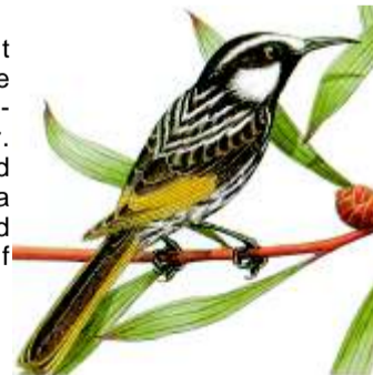
White-cheeked Honeyeater Phylidonyris nigra

The most abundant honeyeaters are the Singing, Brown and White-cheeked Honeyeater. Flowering banksias and other shrubs provide a continuous source of food for six species of honeyeaters.