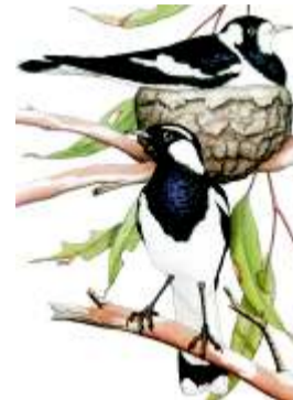
Magpie-lark Grallina cyanoleuca

Wireless Hill is a valuable urban bushland reserve managed by the City of Melville. This remnant Jarrah and banksia woodland is representative of the vegetation community that once existed on the Swan Coastal Plain before urban development. There are many walk trails and Wireless Hill is well known for it's range of wildflowers, including 19 species of orchids.