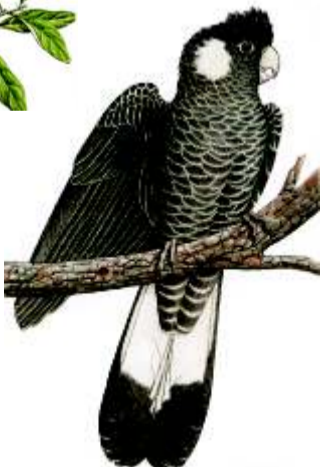
Carnaby's Black-Cockatoo Calyptrorhynchus latirostris

Carnaby's Black-Cockatoo are often present feeding on the pine cones.