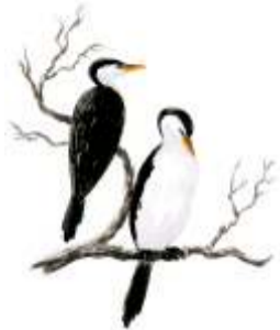
Little Pied Cormorant Phalacrocorax melanoleucos

Unlike most metropolitan lakes, Booragoon Lake is closely surrounded by natural vegetation of Flooded Gum and paperbarks and dense undergrowth. This is an ideal breeding area for water and bush birds. Parking is in Lang Street.