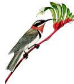
Western Spinebill Acanthorhynchus superciliosus

Murdoch has the largest university campus in Australia and much of its original bushland has been retained, providing a refuge for birds, some now rare in Perth. Parking is available off South Street near the main university buildings, but is often limited on weekdays.