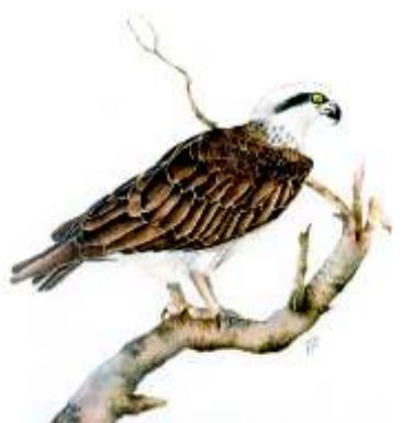
Eastern Osprey Pandion haliaetus

Many raptors visit the area. You should see an Eastern Osprey when you visit. Many birds can be seen on or over the open water - ducks, terns and cormorants.