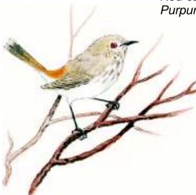
Inland Thornbill Acanthiza apicalis

Yellow-rumped and Inland Thornbill are common. Watch out for a feeding party through the bushes. Western Thornbill are also present.