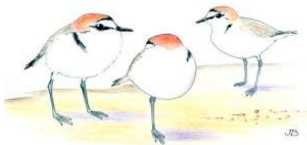
Red-capped Plover Charadrius ruficapillus

The Red-capped Plover is one of the many waders.