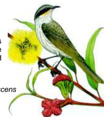
Singing Honeyeater Lichenostomus virescens

You should see raptors such as the Collared Sparrowhawk or Nankeen Kestrel, which hovers above in it's search for lizards and insects.