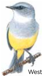
Western Yellow Robin

These roads lead through cleared agricultural land and Jarrah/Marri forest located to the north-east, between the Denmark-Mt. Barker Road and the South Coast Highway, approximately 6km to 10km from Denmark. Look out for Crested Pigeon, Western Yellow Robin, Varied Sittella, Grey Currawong and Rufous Songlark.