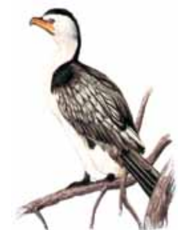
Little Pied Cormorant